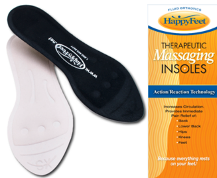
Happy Feet (HH0001 – 8) Dynamic Foot Massage Insoles